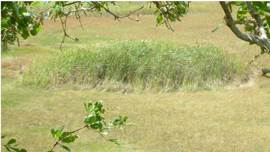
The growth of Typha domingensis clone three years after establishment of a single individual into nitrogen and phosphorus enriched plot. Extension of Typha clone is 23 m from left to right. Location Calabash, 12 th May 2006.