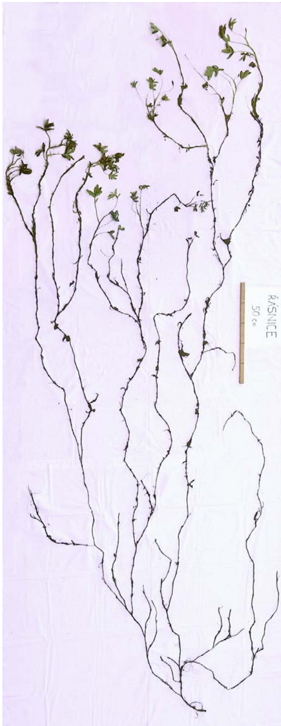
A part of a large clone of Potentilla palustris excavated at location Řásnice in July 2003. The clone is not complete, of course, due to unfortunate lost of its previous parts during digging. However, the stolons were all in rather good shape with no obvious mark of decay. The orientation of rhizomes does not correspond to the original position in the field.