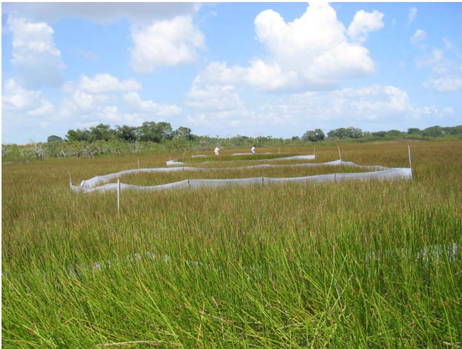
Second year of the fertilization of 10 x 10 m plots in a large field experiment. During fertilization and within next 48 hours, the plastic walls were installed to prevent nutrient leak from the plots. The picture was taken from NP plot and shows the N, P and Control plots behinds respectively. Location New, August 2002.